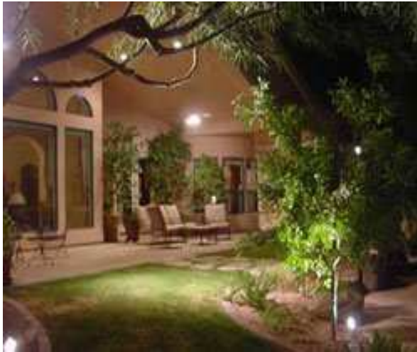
Ready for that late summer garden party!

Spend some time walking around your landscape in the next few weeks and see if you can answer "yes" to the following questions: